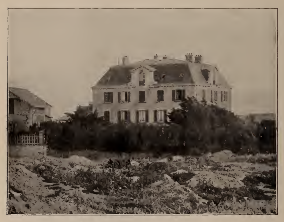
THE HOME OF THE INSTITUTE AT BIARRITZ, FRANCE.

When I was a little girl, father used to tell me how he had spent forty days eating the fruits of the trees and sleeping under their shade without any protection from the savages except what a horse and a pistol could offer; how after those forty days, he ventured to enter into a village, if it could be called that, where the inhabitants had killed every missionary that had slept there for so much as a night. The first intention of that savage people was to kill Friar Nicolás, but he knew that if he fired a pistol they would run away at the noise. It happened as he thought; they were frightened, and the chief